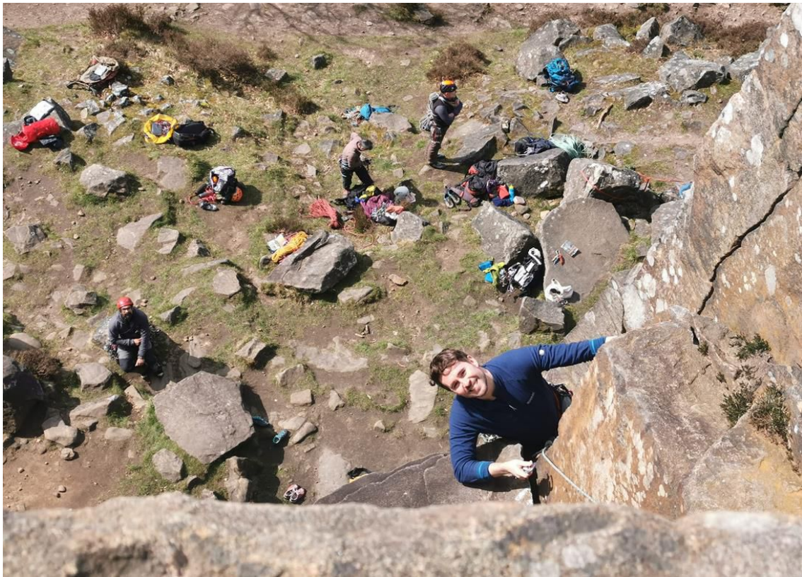
The Meet Leader and some of the team at Froggat.