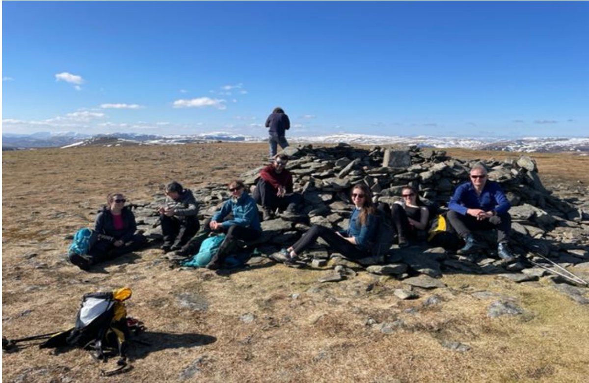
Sunny Scotland on the Glen Clova meet.